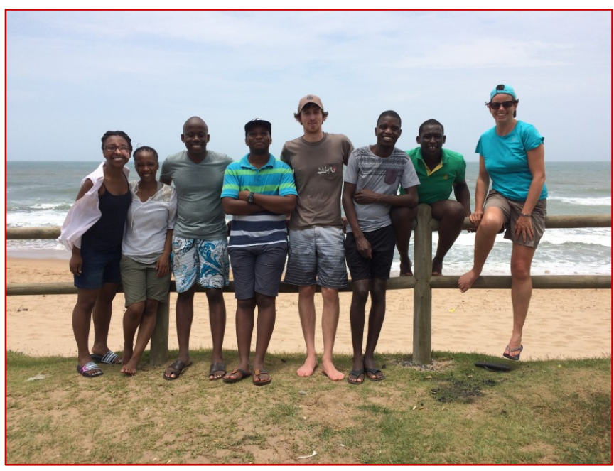
The TBT team 2017

Asisipo : "....also to have grace to adjust to new environment and form more relationships with the students."